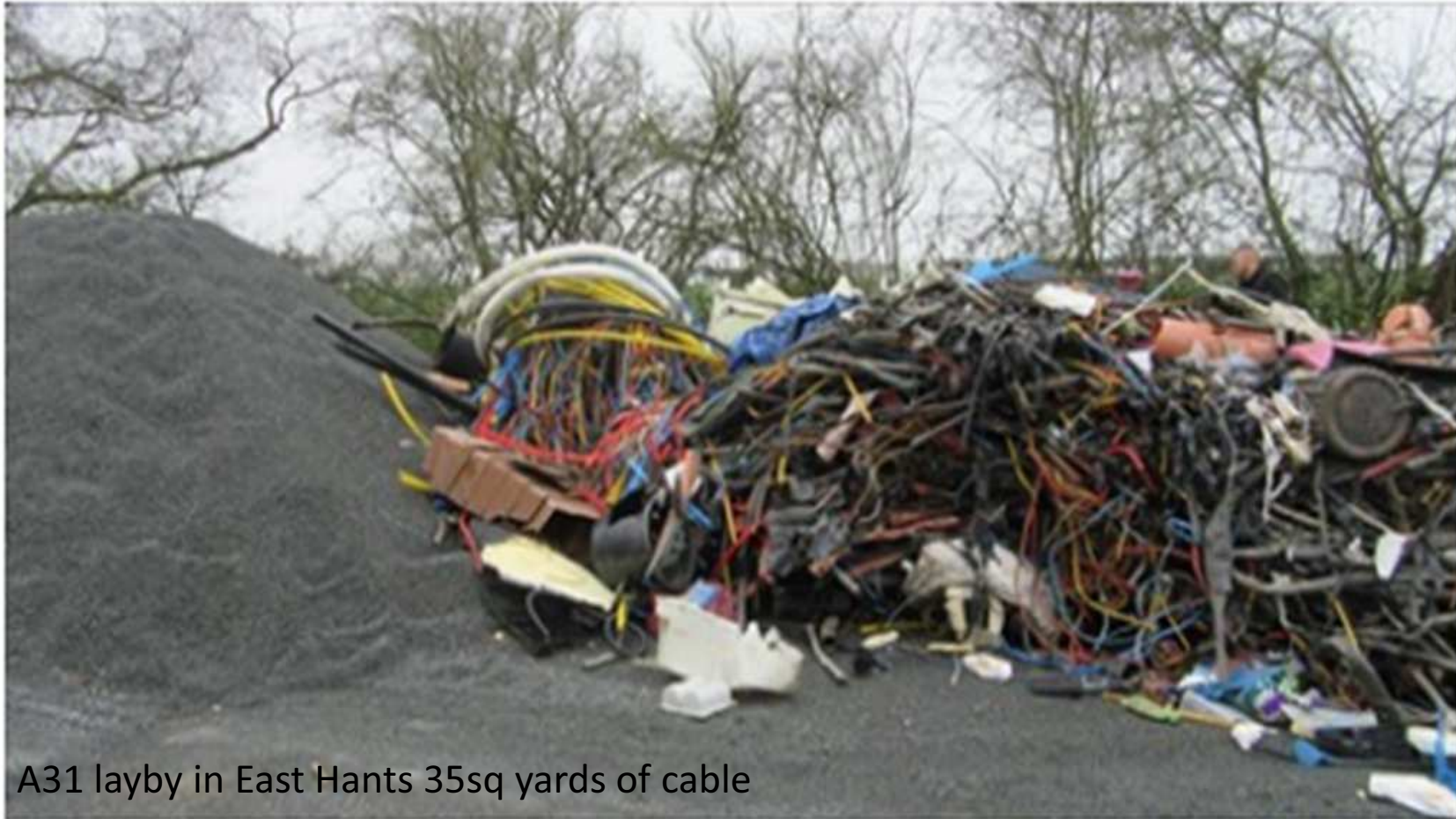
A31 layby in East Hants 35sq yards of cable